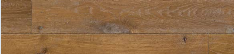
4107 - Chianti