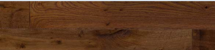
4110 - Shiraz