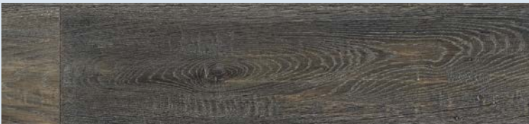
4111 - Pinot