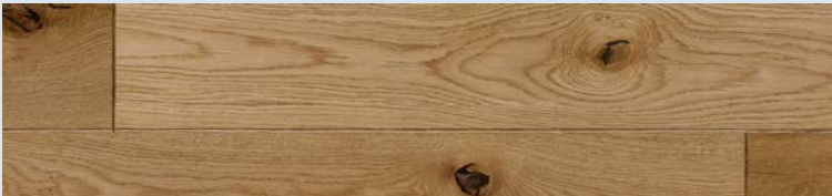
4106 - Champagne