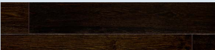
4109 - Calabrese