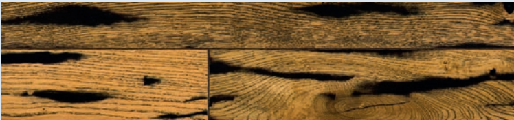
3804 - Devils Tower