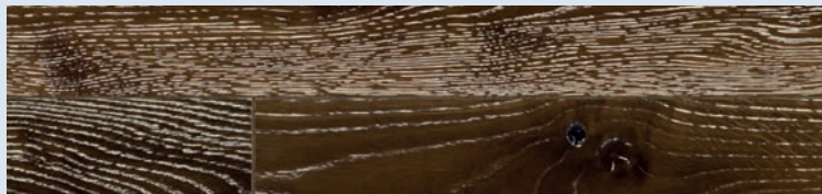
3801 - Muir Woods