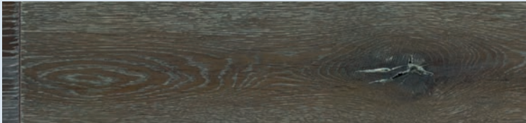
3800 - Misty Fjords