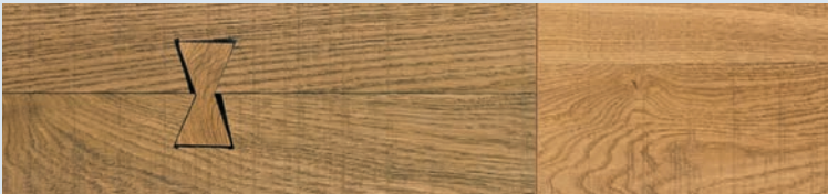
3803 - Fossil Beds