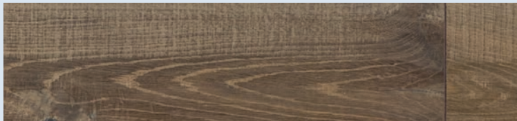
3802 - Natural Bridges