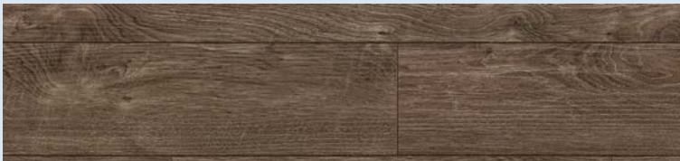
1285 - Chania