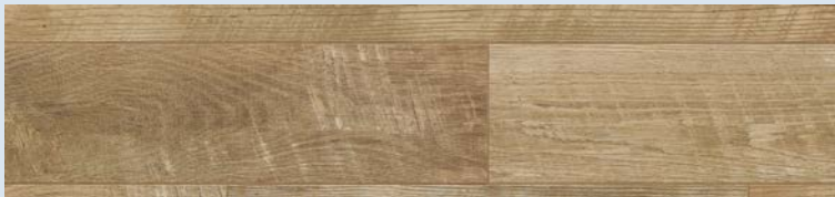
1283 - Geneva