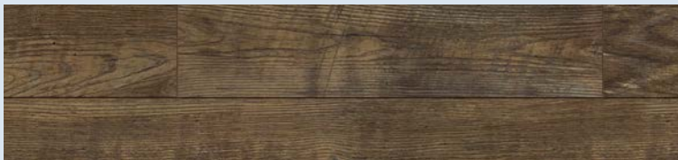
1281 - Bengal