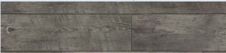
1284 - Glasgow