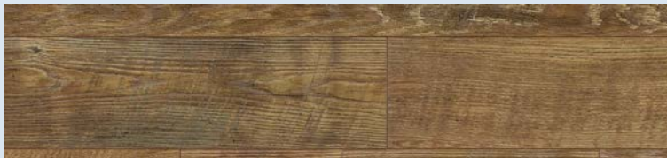
1282 - Lisbon