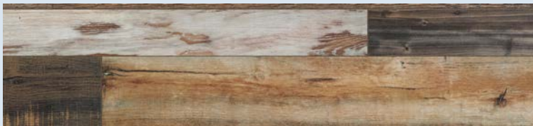
1254 - Castlemoor