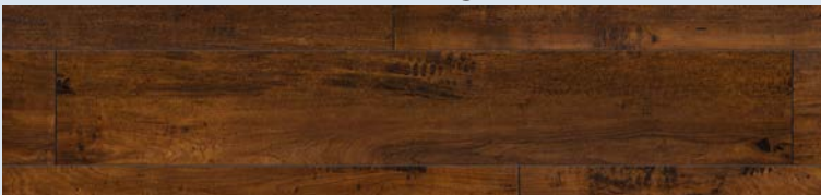
1250 - Brightwyn