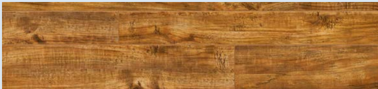
1253 - Silverford