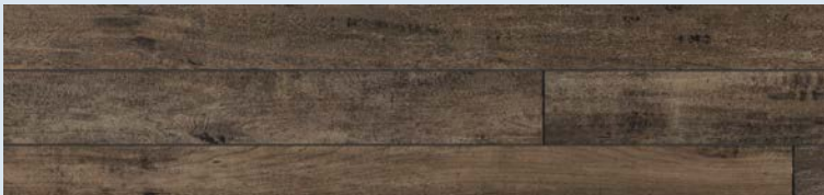
1251 - Foxdell